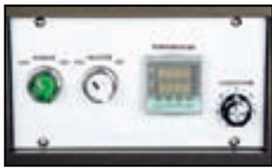
Tunnel Control Panel