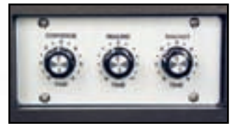
Sealer Control Panel