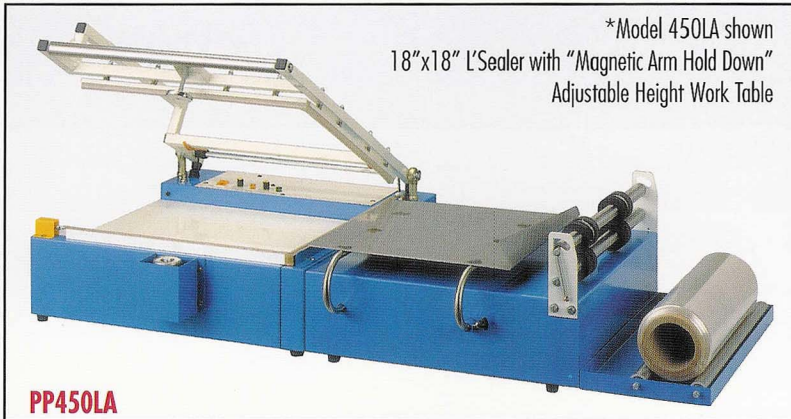
TABLE TOP/PORTABLE SEALERS