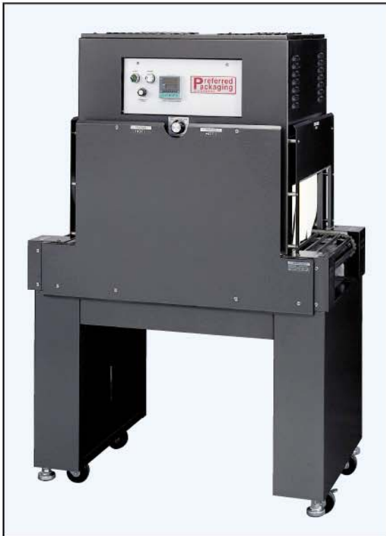
PP1808-28 Shrink Tunnel