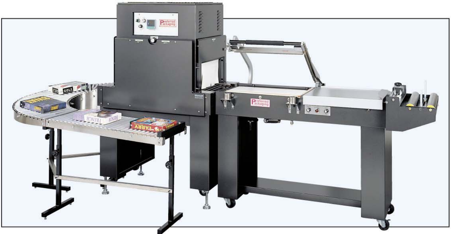
Complete System with Optional 180° Degree Curved Conveyor

*Also Available With 36" Diameter Lazy Susan Product Accumulator.